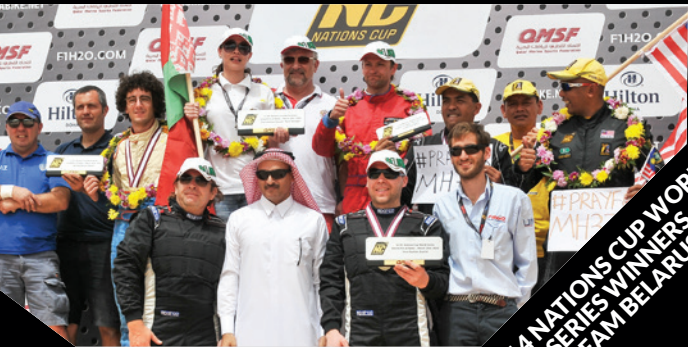
2014 NATIONS CUP WORLD SERIES WINNERS TEAM BELARUS