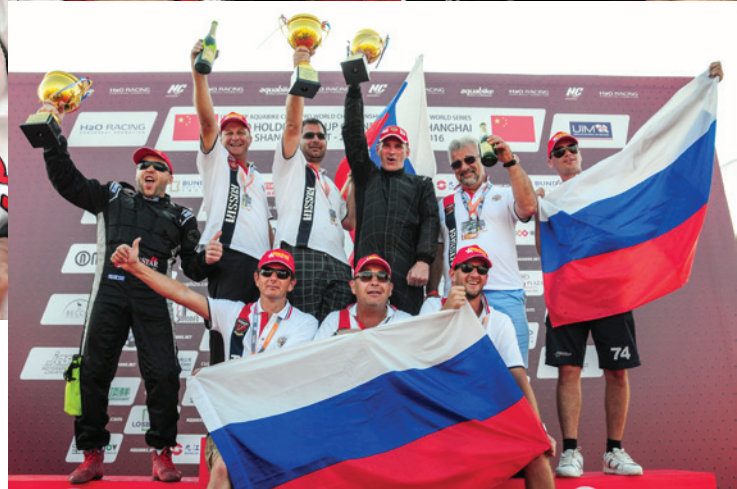
▶ TEAM RUSSIA 2016 UIM H2O NATIONS CUP WORLD SERIES WINNERS