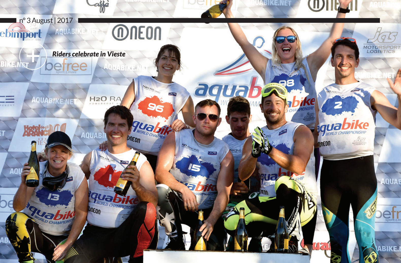
Riders celebrate in Vieste

the race in fourth place and looked to be on course to make it a Poret two-three-four, but dramatically came off his Ski passing a group of backmarkers just before the finish line, eventually clambering back on board and finishing in eighth.