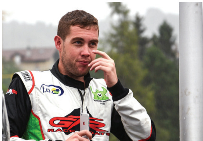
Trask will be hoping to build on his best ever qualifying showing last time out.